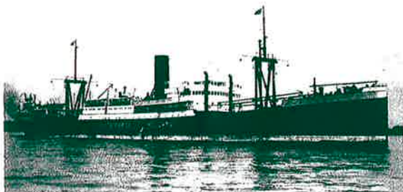
Nz 82 Kota Baroe AP In charter by USWSA. Picture taken before "Measure 22" camouflage was applied.